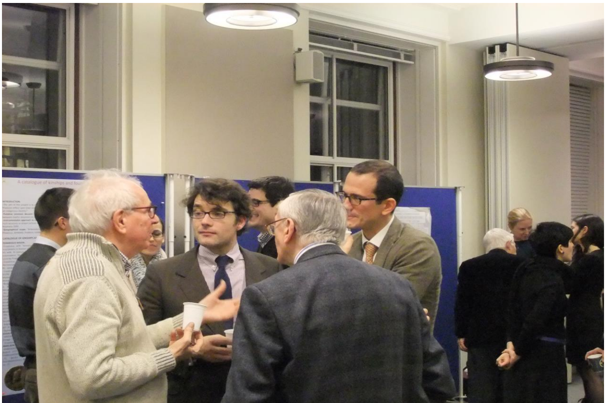
More discussion at the poster session!