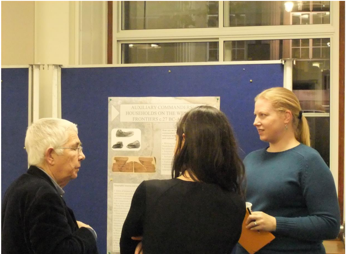
Participants in discussion during the poster session.